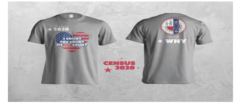
Census t-shirts are on sale at the NVOC bookstore. Buy one and wear it on Friday to support SkillsUSA.